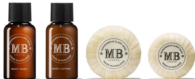
BODY Body Wash Body Lotion 50g Soap 30g Soap

Available in 30ml (1fl oz) and 50ml (1.7fl oz).