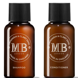
HAIR Shampoo Conditioner