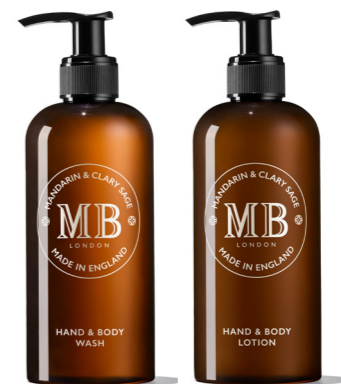
HAND & BODY Hand & Body Wash Hand & Body Lotion

Available in 300ml (10.1fl oz) and 5L (169.1fl oz).