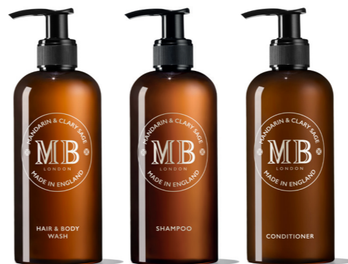
HAIR & BODY Hair & Body Wash Shampoo Conditioner