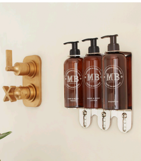
Top: Luxury Collection One Bespoke Glass Bottles & Double dispenser Bottom: 1971 Triple Dispenser

Luxury Collection One and 1971 Dispensers are available in a single, double and triple format.