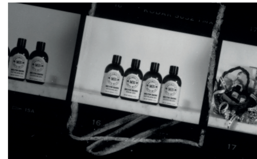
Top: The 1971 Original Bottle Bottom: Bath Milk Selection Archives