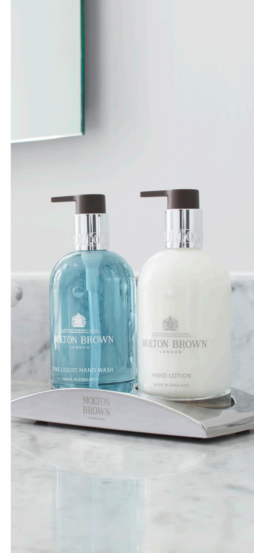
Right: The Elemental Arc

*Currently only available for UK, Europe, Middle East, Africa & Australia.