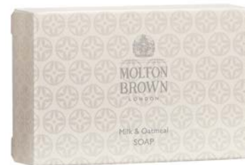
Milk & Oatmeal Soap

Available in 25g (0.88oz) and 45g (1.59oz)