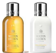
Vetiver & Grapefruit Bath & Shower Gel and Body Lotion