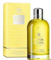
Orange & Bergamot

Made to beautifully nourish and replenish skin, refined fragrances enrich each individual bathing oil for a sumptuous bathing ritual.