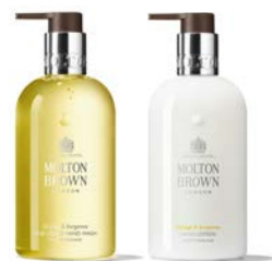
Orange & Bergamot Fine Liquid Hand Wash and Hand Lotion

Indulge your guests in our luxury Hand Care, bursting with rich, aromatic notes whilst nourishing and caring for the skin. House them in our chrome dispenser to add a sleek finishing touch to your bathrooms.