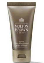
Serene Coco & Sandalwood Body Lotion

*Only available for Serene Coco & Sandalwood.