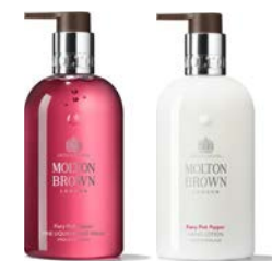
Fiery Pink Pepper Fine Liquid Hand Wash and Hand Lotion

LONDON VIA REUNION ISLAND A humid dusk on the descent of Cirque de Salazie. Jewelled birds of paradise flaunt across warm air. The scent of crushed sweet spices drift over colourful rooftops. Entice curiosity with aromatic adventure.