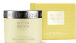
Orange & Bergamot

Each indulgent Body Polisher is enriched with a unique exfoliating ingredient and iconic fragrance. Experience caressingly soft, beautifully scented skin.