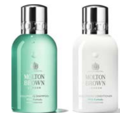
Kumudu Volumising Shampoo and Conditioner

Available in 30ml (1 fl oz), 50ml (1.7 fl oz), 100ml (3.4 fl oz), 300ml (10.1 fl oz), 5L (169.1 fl oz).