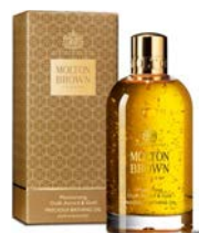
Mesmerising Oudh Accord & Gold