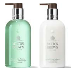
Refined White Mulberry Fine Liquid Hand Wash and Hand Lotion

LONDON VIA LES CEVENNES Winding rivers flowing through verdant valleys. Mulberry trees hooked along the slopes in early morning mist. Freshly tied bouquet garnis, just gathered. Renew your senses with a ramble through the mountains.