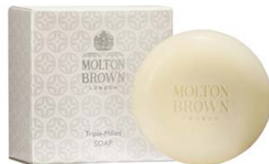
Triple Milled Soap – boxed

Available in 25g (0.88oz) and 45g (1.59oz)