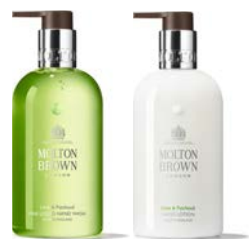
Lime & Patchouli Fine Liquid Hand Wash and Hand Lotion

LONDON VIA THAILAND An alfresco bay market, shaded under a parasol of palm fronds. The piercing zest of verdant green makrut limes. Bountiful clusters of shiny, crushed leaves and glass bottles filled with rich oils. Uplift your essence with the abundant flavours of Ban Krut.