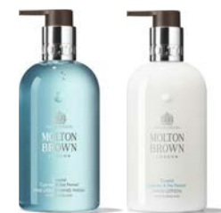
Coastal Cypress & Sea Fennel Fine Liquid Hand Wash and Hand Lotion

LONDON VIA CAPE YORK A salt-sprayed collision of the ocean swell against rugged outcrops. Waves lapping in uncharted caverns. A peninsula awaiting great exploration. Awash your senses with sea-soaked adventure.