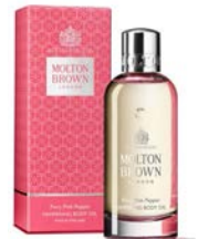
Fiery Pink Pepper