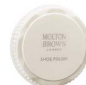
Shoe Polish (Resealable)