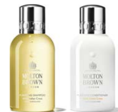
Indian Cress Purifying Shampoo and Conditioner

The plant and mineral extracts in our irresistibly scented Shampoos and Conditioners make hair look shiny and healthy with a beautiful, lingering fragrance.