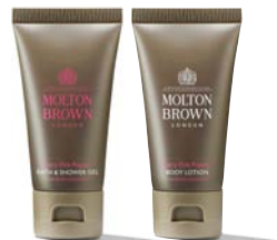
Fiery Pink Pepper Bath & Shower Gel and Body Lotion

*Only available for Fiery Pink Pepper Bath & Shower Gel.