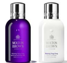
Relaxing Ylang-Ylang Bath & Shower Gel and Body Lotion

LONDON VIA THE COMOROS ISLANDS Creamy-white, soft, secluded sands. The air heady with the scent of sweet evening flowers. A hammock swaying between two palms. Fall into a deep slumber on the Perfume Isles.