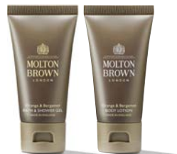
Orange & Bergamot Bath & Shower Gel and Body Lotion

LONDON VIA SEVILLE A courtyard of orange trees in dappled shade. Lively citrus airs dancing the flamenco at dawn. Azure blue skies above. Awaken your spirits with our modern classic, plucked from the naranja grove.