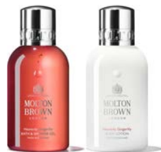
Heavenly Gingerlily Bath & Shower Gel and Body Lotion

LONDON VIA TAHITI Black sands slipping into a Polynesian lagoon. Delicate ginger lilies peek through the foliage. Fragrant spices perfuming the breeze. Entice your wanderlust with an escape to Tahitian shores.