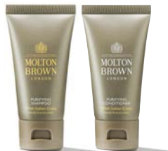
Indian Cress Purifying Shampoo and Conditioner

The plant and mineral extracts in our irresistibly scented shampoos and conditioners make hair look shiny and healthy with a beautiful, lingering fragrance.