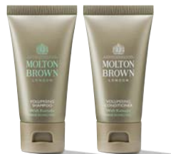
Kumudu Volumising Shampoo and Conditioner

Out with daily grime. In with a shampoo for smooth, shiny hair with aromas of jasmine, honeysuckle and sandalwood.