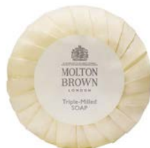
Triple Milled Soap – pleat wrapped

Enrich their cleansing ritual with our creamy triple-milled milk soaps, designed to clean, nourish and protect the skin.