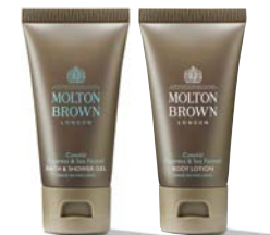
Coastal Cypress & Sea Fennel Bath & Shower Gel and Body Lotion

LONDON VIA CAPE YORK A salt-sprayed collision of the ocean swell against rugged outcrops. Waves lapping in uncharted caverns. A peninsula awaiting great exploration. Awash your senses with sea-soaked adventure.