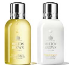
Orange & Bergamot Bath & Shower Gel and Body Lotion

LONDON VIA SEVILLE A courtyard of orange trees in dappled shade. Lively citrus airs dancing the flamenco at dawn. Azure blue skies above. Awaken your spirits with our modern classic, plucked from the naranja grove.