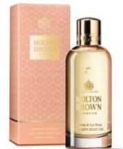
Jasmine & Sun Rose

Our enriching dry oils melt into skin, leaving it feeling soft, smooth and nourished. Imbued with distinctive aromas for a truly indulgent sensorial experience.