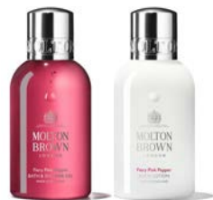
Fiery Pink Pepper Bath & Shower Gel and Body Lotion

LONDON VIA REUNION ISLAND A humid dusk on the descent of Cirque de Salazie. Jewelled birds of paradise flaunt across warm air. The scent of crushed sweet spices drift over colourful rooftops. Entice curiosity with aromatic adventure.