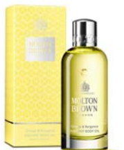
Orange & Bergamot