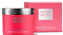
Fiery Pink Pepper