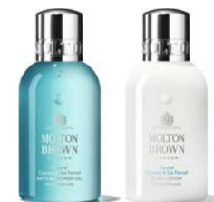
Coastal Cypress & Sea Fennel Bath & Shower Gel and Body Lotion

LONDON VIA CAPE YORK A salt-sprayed collision of the ocean swell against rugged outcrops. Waves lapping in uncharted caverns. A peninsula awaiting great exploration. Awash your senses with sea-soaked adventure.