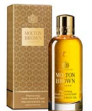
Mesmerising Oudh Accord & Gold